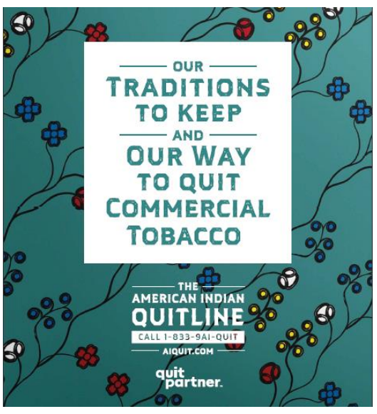
Figure 3: Flyer of The American Indian Quitline 15

The twofold intoxication of commercial tobacco can also be seen through the example of the American Indian Commercial Tobacco Program (see fig. 3): Operated by National Jewish Health - an academic hospital specialized in respiratory issues – the program was "created for American Indians with input from American Indians" (note that American Indian is a self-chosen term here).<sup>13</sup>