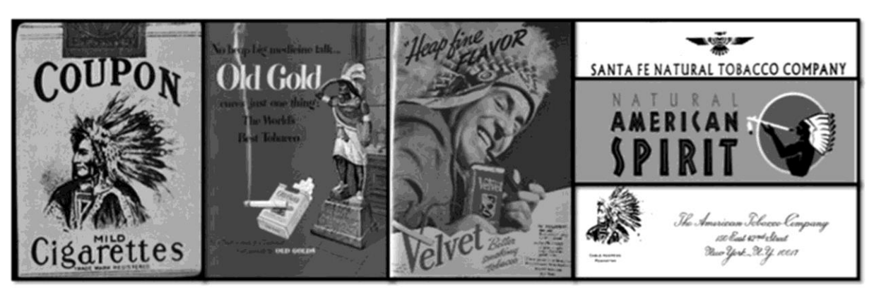
Figure 1: Examples of images used in commercial tobacco marketing<sup>2</sup>

The mystique of Indianness <sup>1</sup> is a theme that has been used since the 20<sup>th</sup> century in the United States, Canada but also many other white countries – including Germany - to distort, exploit and capitalize the lived experiences of Native Americans.