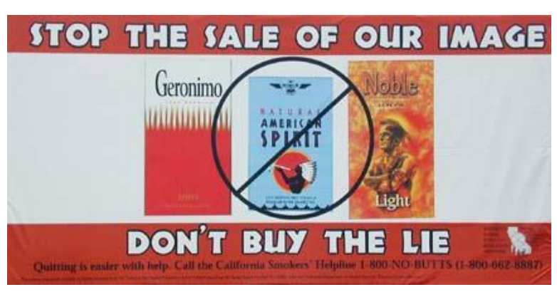
Figure 2: Counter marketing billboard aimed at cigarette brands 12

It is important to consider the resistance that comes from Indigenous people in North America as up until now they face harm due to commercial tobacco and its marketing. One example of resistance includes a counter-marketing initiative based in California that criticizes cigarette brands using traditional Native American imagery on their packaging (see fig. 2). Health education specialist Claradina Toya, a Najavo/Jemez Pueblo Indigenous person, remarked that the packaging not only exploits their symbols and practices but also plays down the threats of smoking cigarettes, which is a major health treat especially for Indigenous communities as two out of five Indigenous people die of tobacco abuse.<sup>11</sup>